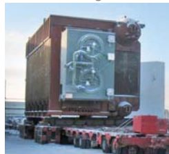
Sturgeon - Canada (3x35 MWe)