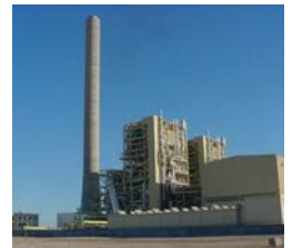
Port Said - Egypt (2x341 MWe)