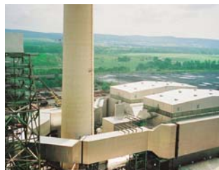
PPL, Montour - PA, USA (2x750 MWe)