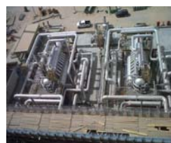
Reference Unit - ME (100 MWe)