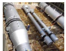
Duba Green - KSA (50 MWe)