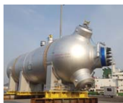
Hassyan - UAE (4x600 MWe)