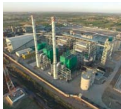
Fátima - Pakistán (2x60 MWe)