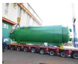
SPP Gulf - Thailand (95 MWe)