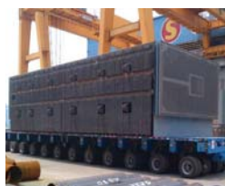
Yambu - KSA (5x620 MWe)