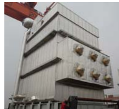
Louisiana Project - USA (75 MWe)