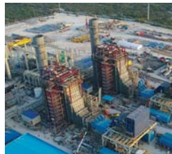
Noreste - México (2x465 MWe)