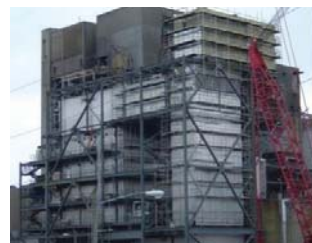
AEP, Muskingum River - OH, USA