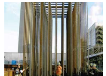
ESP Rebuild, USA