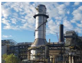
Freeport - McMoRan, Miami Smelter - AZ, USA